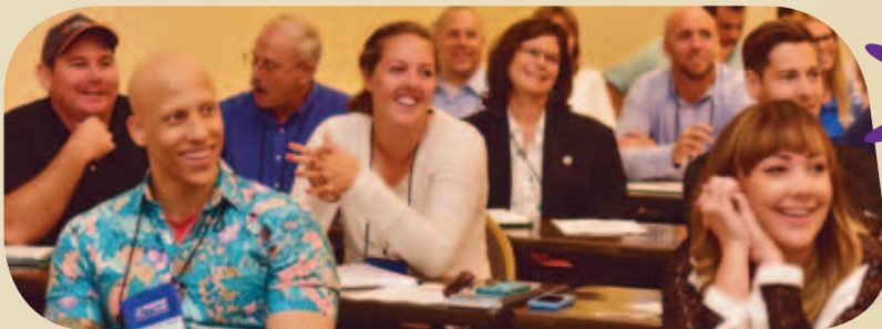
Exhibit with KEY SUPPLIERS , meet WATERPARK & RESORT PROFESSIONALS and network with UNIQUE BUYERS from around the world!

The headquarter hotel and convention center are connected by the scenic Riverwalk along the mighty Mississippi.