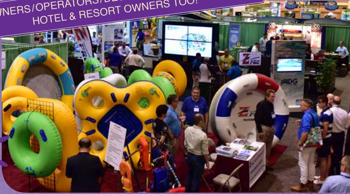
EXHIBIT AT THE ONLY TRADE SHOW SPECIFICALLY FOR WATERPARKS & RESORTS

OWNERS/OPERATORS/DESIGNERS/DEVELOPERS/ HOTEL & RESORT OWNERS TOO!